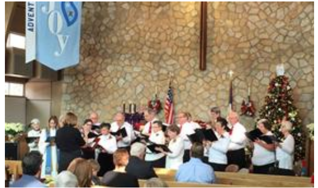
Christmas Cantata December 17th