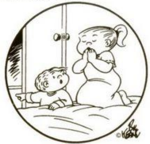
"No, Dolly, our father art downstairs watching TV."